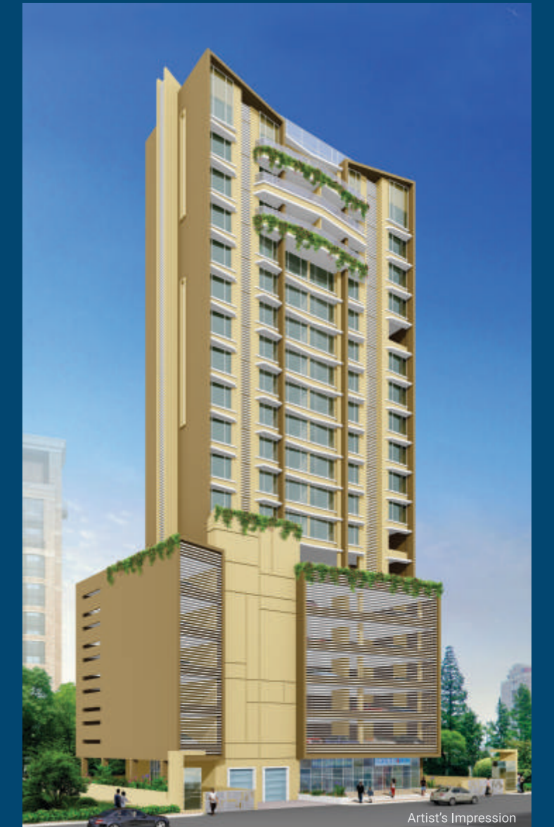
HELICON HEIGHTS - Link Road, Borivali West