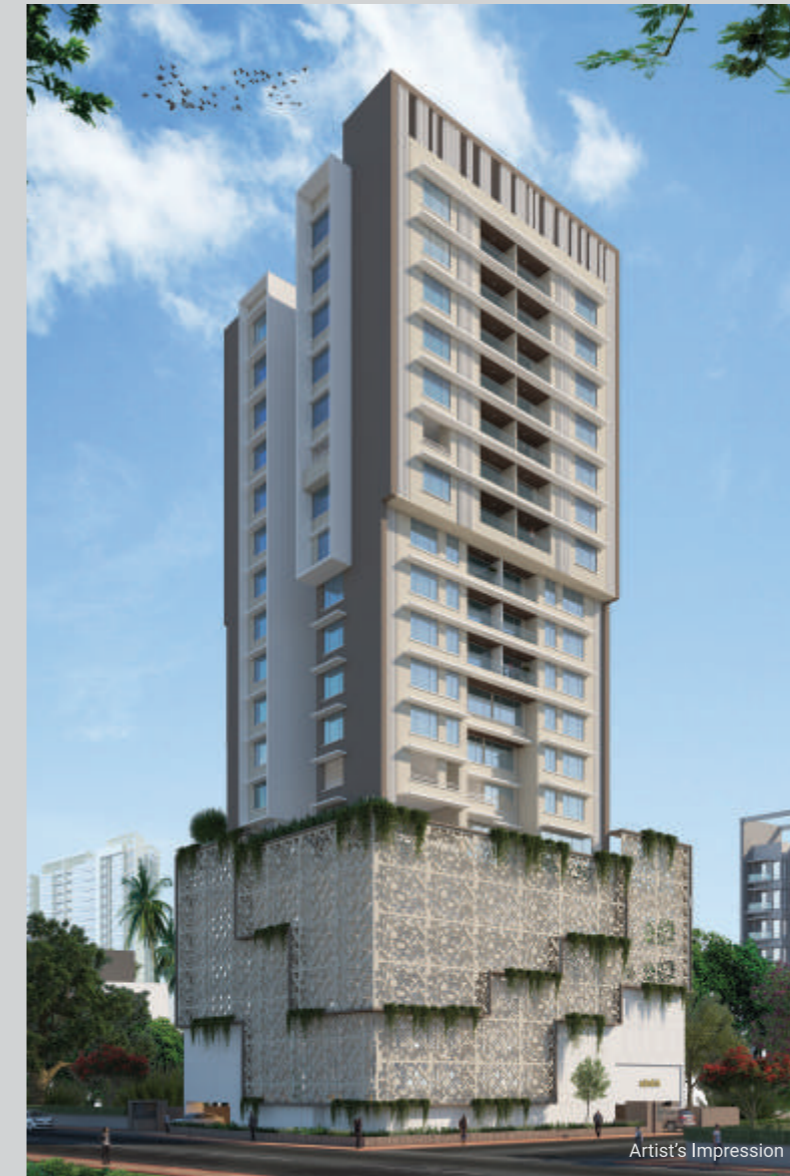
ANTARIKSH - Chandavarkar Road, Borivali West