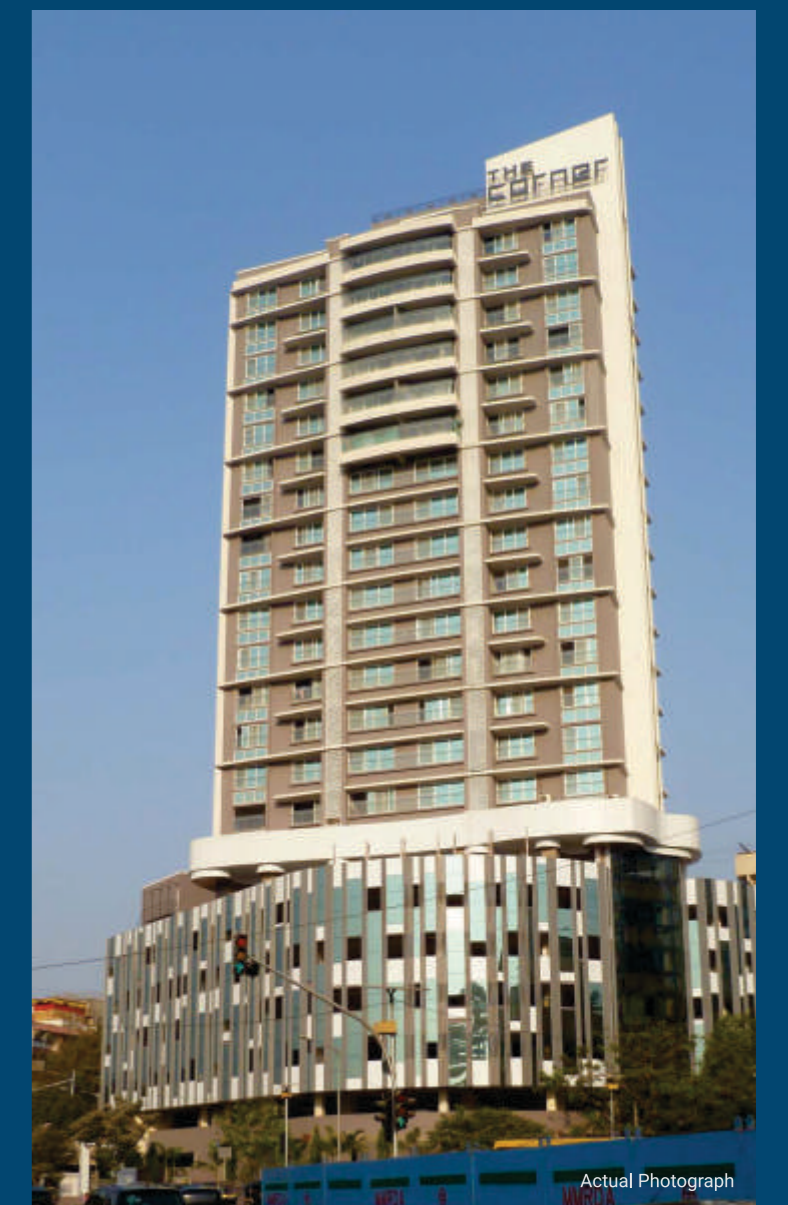
THE CORNER - Link Road, Borivali West