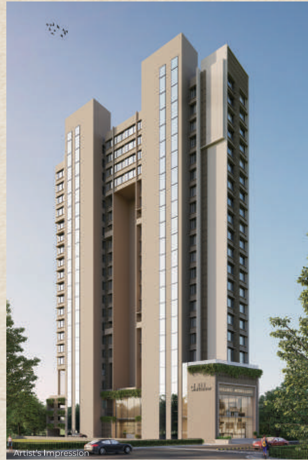
Artist's Impression SITE: SHIKHAR (SHREE RAGHUVANSHI CHS LTD.), CHANDAVARKAR ROAD, BORIVALI (W)